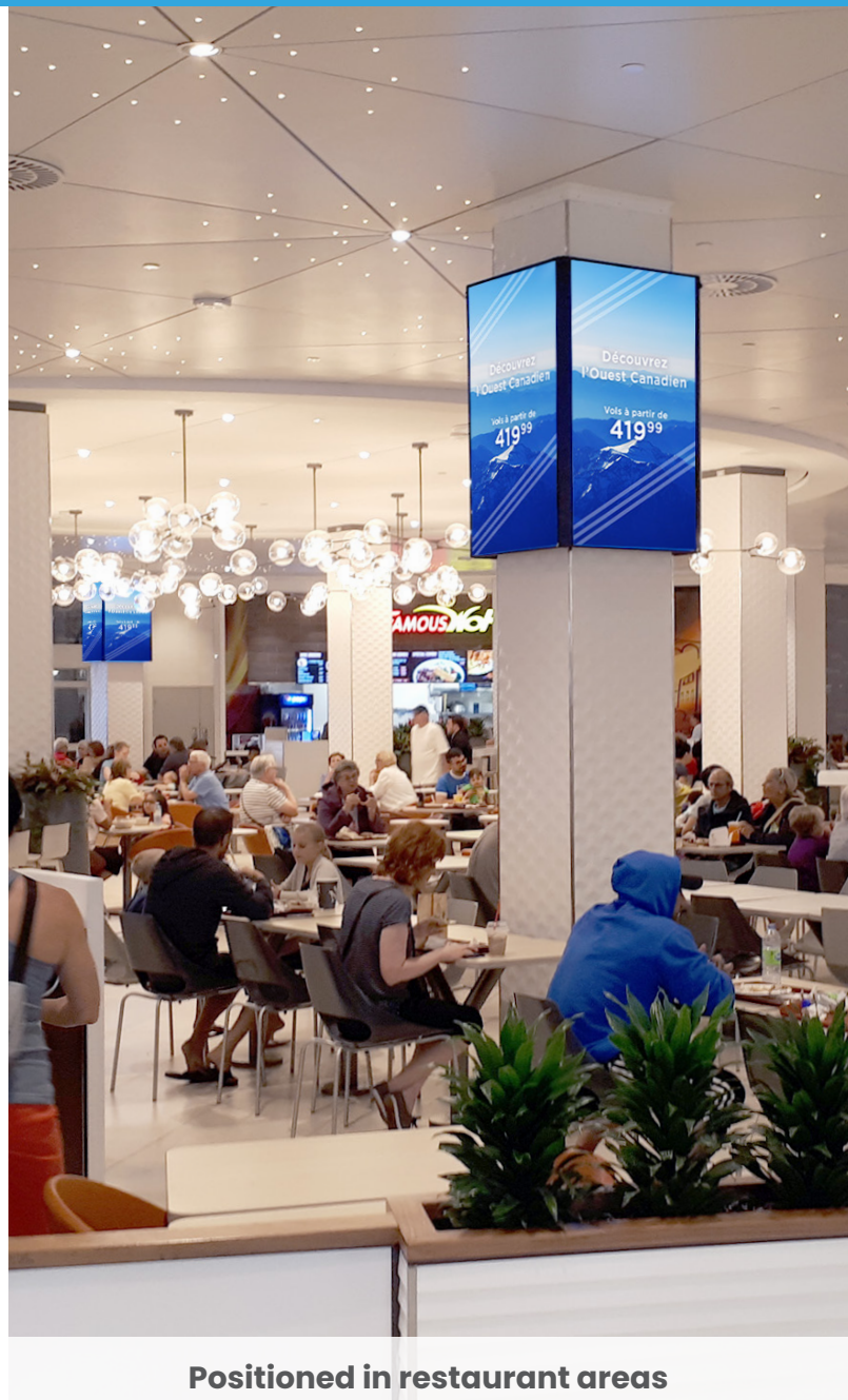
Positioned in restaurant areas

This document covers the production specs to build digital vertical ads. Best practices for producing effective and attractive visuals. What files to send our production team to build your ads in full-motion video. Uploading artwork to our WeTransfer page.