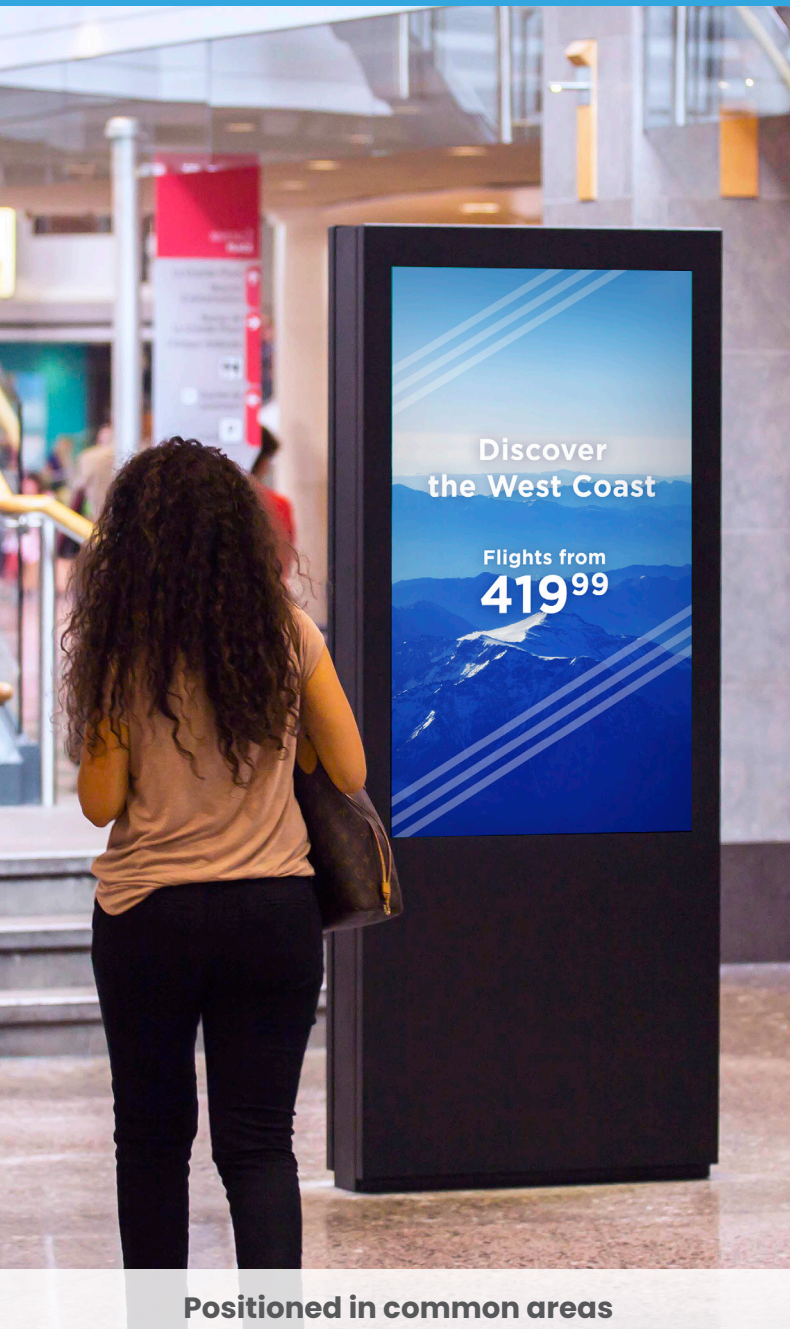
Positioned in common areas