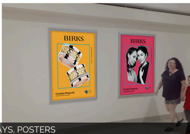
DIGITAL DISPLAYS, POSTERS

This family-orientated regional shopping centre is the destination of choice for suburban communities east of the Greater Toronto Area (GTA). Conveniently located just off Highway 401, shoppers can also take advantage of excellent public transit options offered by both Durham Region Transit and GO Transit, the latter of which connects commuters to the centre via a pedestrian bridge. Saks Fifth Avenue OFF 5TH, H&M and Hudson's Bay are a few of the centre's highly desirable retailers, while Jack Astor's Bar & Grill and Moxie's Grill & Bar entice visitors looking for quality dining options. Famous Players Theatre and Farm Boy Fresh Market are two more attractions that make Pickering Town Centre a unique and popular destination.