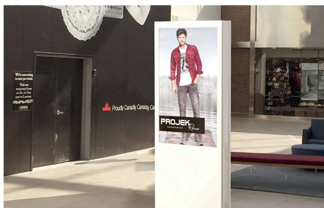
SPECIALTY MEDIA, DIGITAL SPECTACULAR, DIGITAL DISPLAY

Located on the Halifax peninsula, just off Highway 102 and minutes from downtown, Halifax Shopping Centre enjoys an educated customer base in a stable economy. Halifax is the region's only urban centre, with a diverse population of professionals and over 30,000 students from five degree-granting universities. With distinctive and unique-to-the-region brands like Apple, Aritzia, Banana Republic, Browns, Coach, Fossil, Hollister, Michael Kors, Victoria's Secret and Zara. It's no surprise that Halifax Shopping Centre draws visitors from across Atlantic Canada. Combined with Halifax Shopping Centre Annex, the Centre features over 170 retailers, a unique combination of big box and traditional retail, and five on-site office buildings.